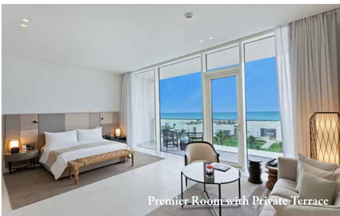
Premier Room with Private Terrace