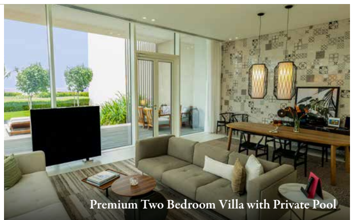
Premium Two Bedroom Villa with Private Pool